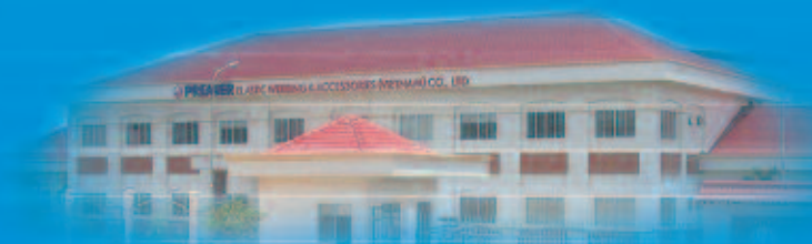
Premier Elastic Webbing & Accessories (Vietnam) Co., Ltd.