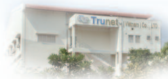
Trunet (Vietnam) Co., Ltd.