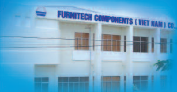
Furnitech Components (Vietnam) Co., Ltd.