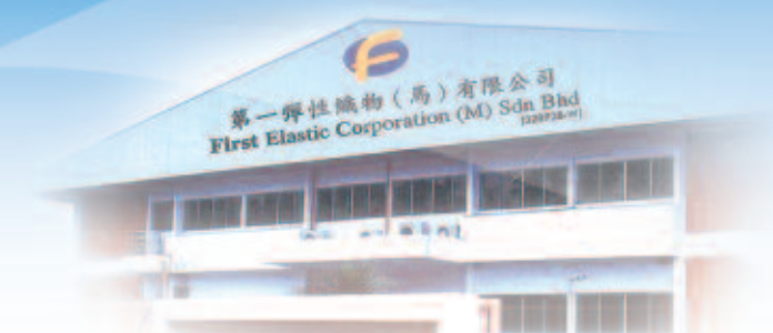
First Elastic Corporation (M) Sdn. Bhd.