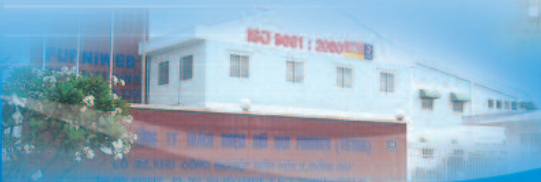
Furniweb Manufacturing (Vietnam) Co., Ltd.