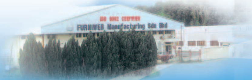
Furniweb Manufacturing Sdn. Bhd.