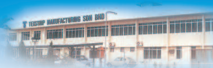
Texstrip Manufacturing Sdn. Bhd.